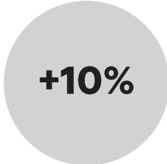
Budget Increase for 2024