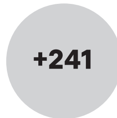
Click Church Subscribers on YouTube in 2023

Before Click Church began, we had been creating content for Bromley itself - some content being our kids videos. Even now, those videos are the ones that have reached the biggest audience for Bromley. We hope to create more things in the same vein that mesh with Bromley's community and those we are trying to reach.