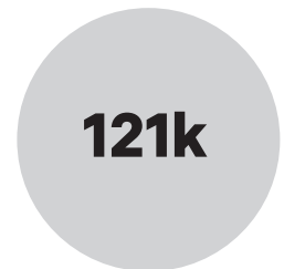
Views of Click Church videos in 2023