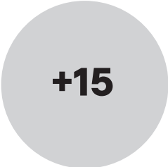
First Time Donors to Bromley in 2023

Thank you again for your support of Bromley Road Baptist Church. Through your financial giving, we are able to fulfill our mission - to lead people into a growing relationship with Jesus Christ, one step at a time.