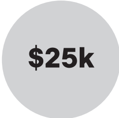
Money sent to our Mission Partners in 2023