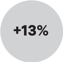
Giving increase in 2023